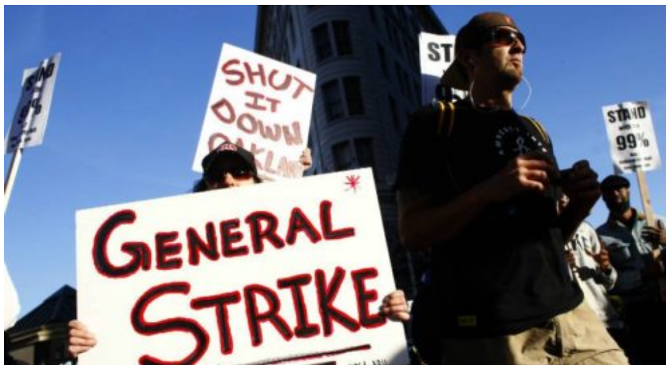
General Strike protests in Oakland

In this century, it was Ralph Nader in 2000 who first advocated single-payer, Medicare for all. Jill Stein ran on the Green New Deal in both her Green Party campaigns, after Howie Hawkins , the current leading candidate in the Green Party in 2020, advocated for a Green New Deal in a gubernatorial run in 2010. Every Green since Nader has criticized corporatism, the wealth divide, and Wall Street corruption as well as never-ending wars and US imperialism. All of these issues are advocated for by social movements and now have majority support. They are on the national agenda.